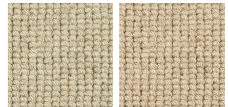
808 Antique White