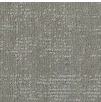
476 New York Stone