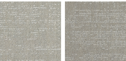
475 Boston Beige 476 Sydney Sand