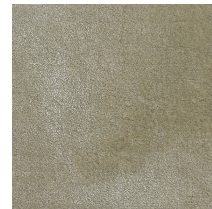
415 Softest Moss