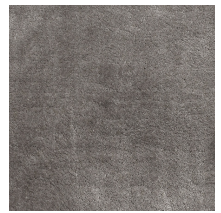
411 Spirit Grey