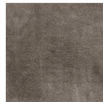
417 Velvet Earth