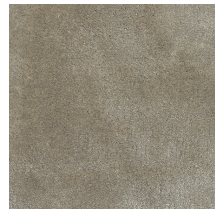
416 Champagne Fizz