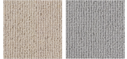
82 Threshed Wheat