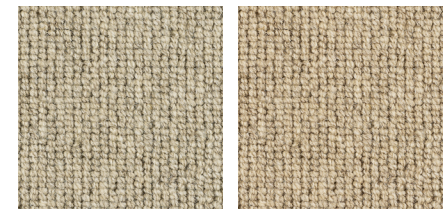
908 Old Lace