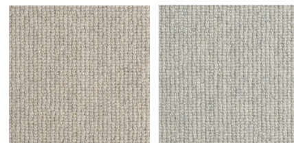
330 Bath Stone